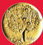
JAPAN QUALITY MEDAL 2007