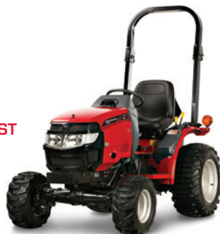
Max 24 HST