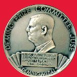
DEMING PRIZE 2003