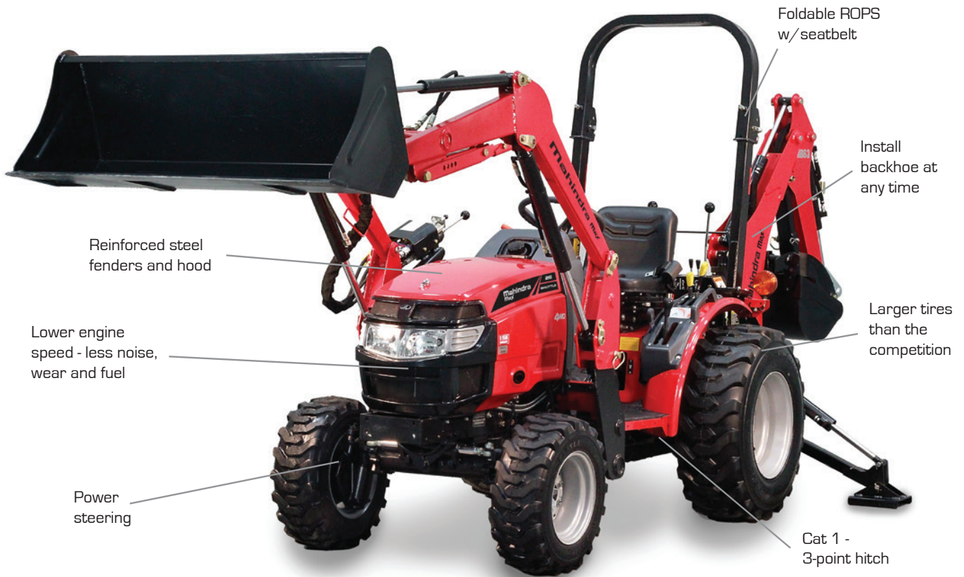
Max 26XL Shuttle

Warranty - 7-year limited powertrain (See Mahindra warranty and your dealer for details)